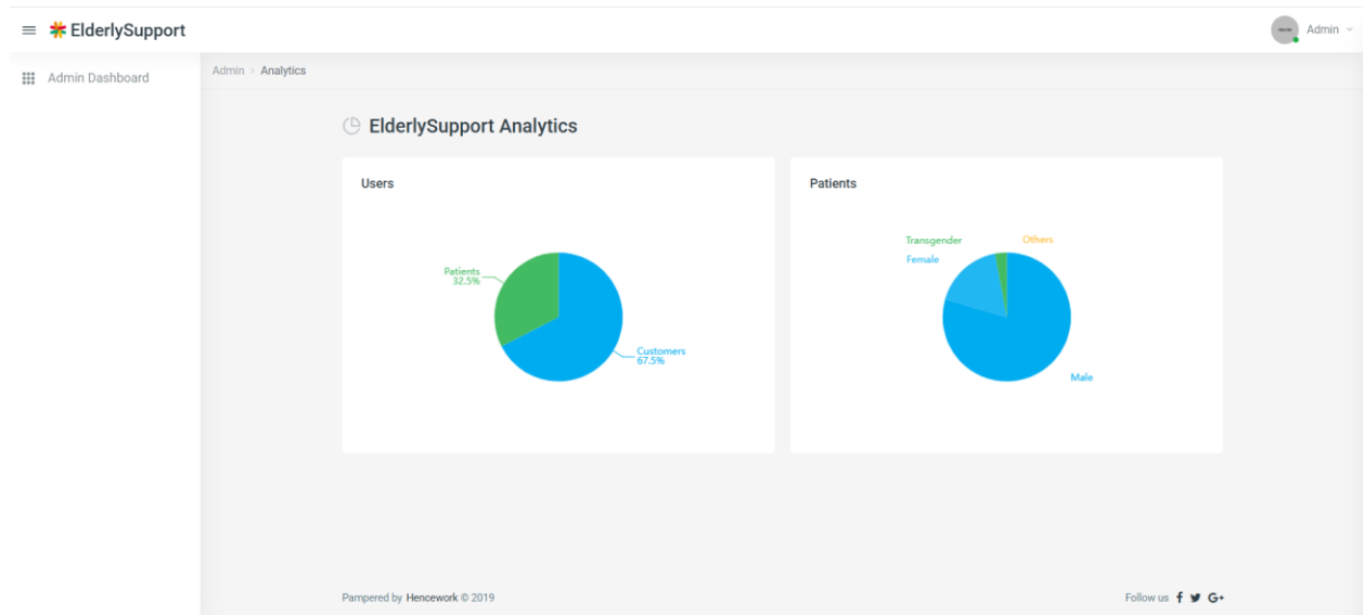
Analytics dashboard displaying user and patient demographic insights.